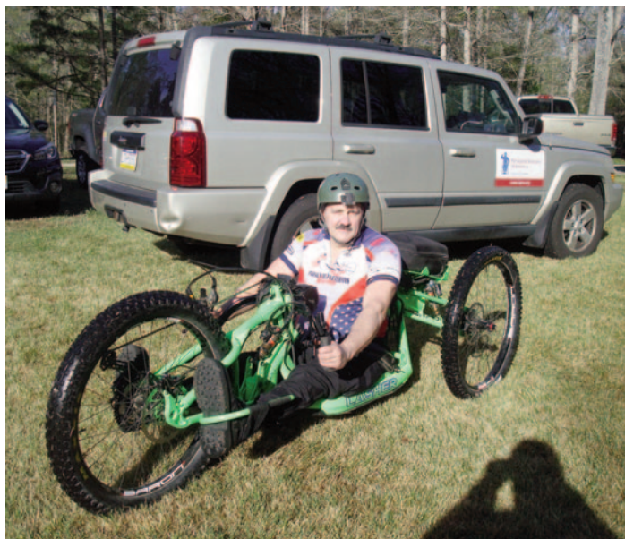
the Great Race on 22-23 September, and the EQT Pittsburgh 10 Miler on 06 November.

Some upcoming events in Pittsburgh that include a handcycling division are the Pittsburgh Marathon on 07 May;