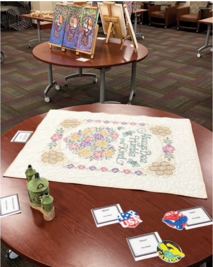
Other entries in the VA Pittsburgh Healthcare System Veterans Art Show held in August.