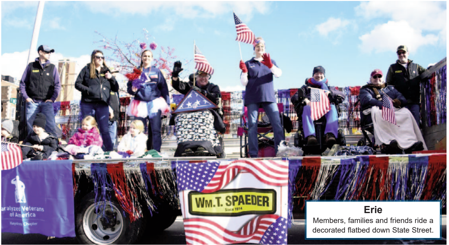
Erie Members, families and friends ride a decorated flatbed down State Street.