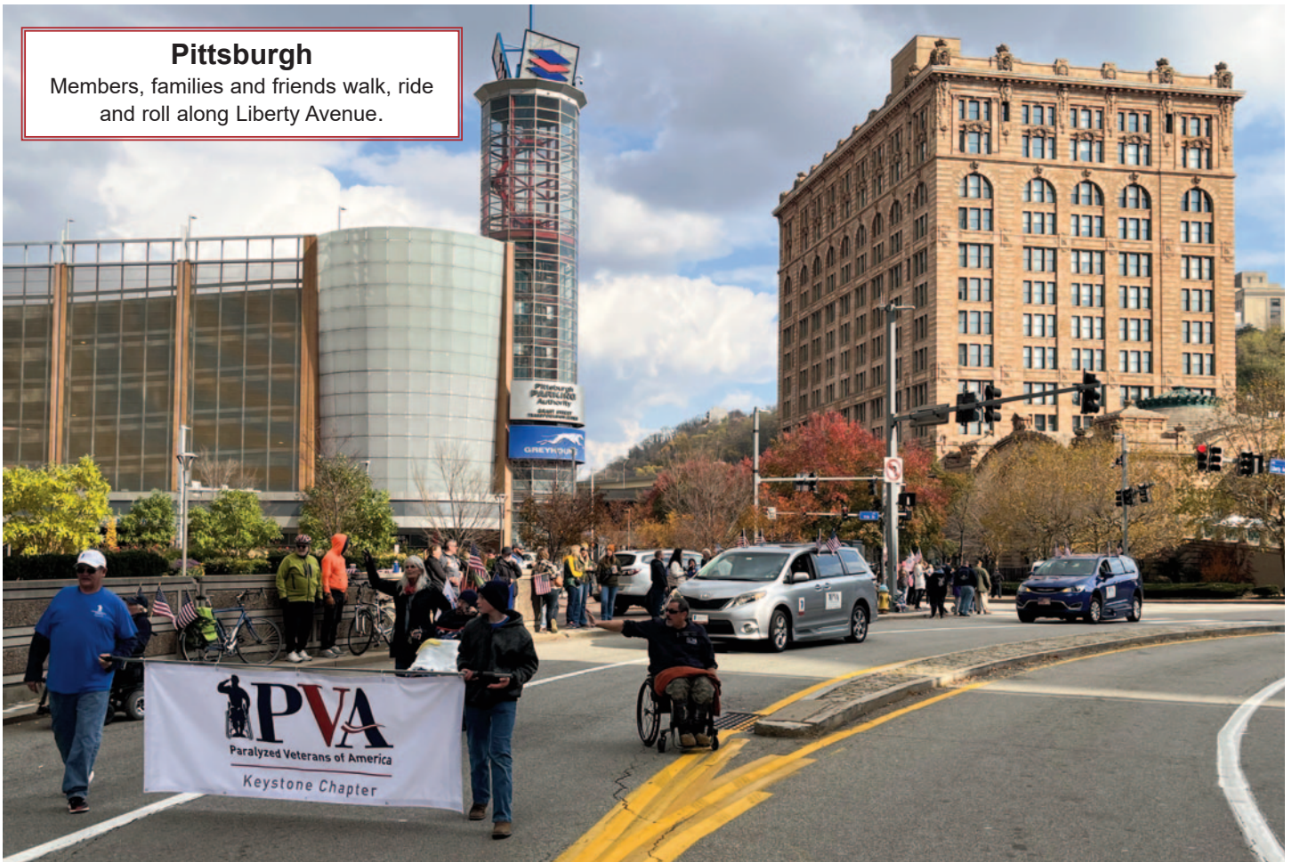
Pittsburgh Members, families and friends walk, ride and roll along Liberty Avenue.